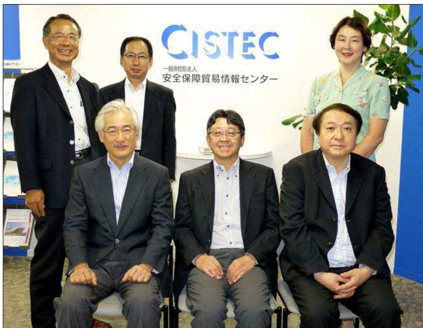
Members of the CISTEC management team